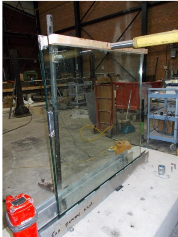
Plate 1 - Generic Test Arrangement Line Load