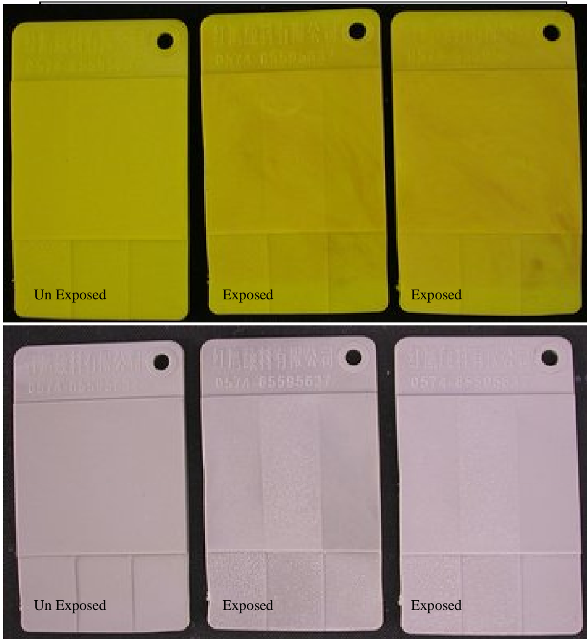
Fig. 1. Views of the samples post test (unexposed swatches are shown on the LHS).